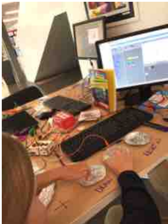
Interaction with Makey Makey DIY console